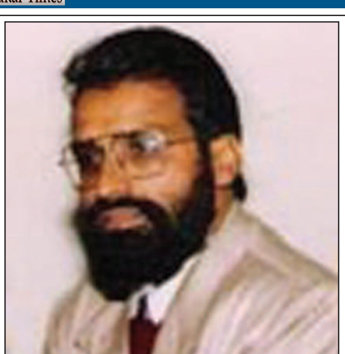
Ambedkar Times and Desh Doaba Fondly Remember